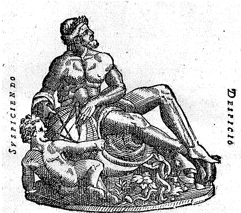
Greek god Uranus

Have you ever wondered why ancient people created myths? Perhaps it is because they had so many questions about the world. They might have wondered why the sun rose. Or maybe they wondered why lightning and thunder happen.